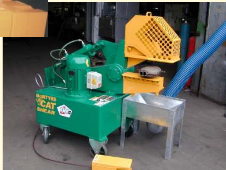
Right: catalytic convertor option