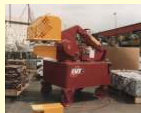
320 12" shear