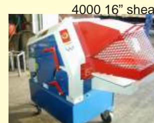
4000 16" shear