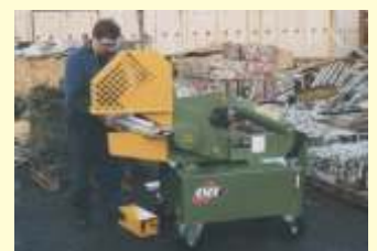
407 16" shear 640 24" shear