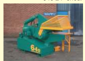
640 24" shear