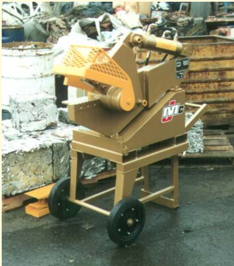
200B with wheeled stand option

A small machine with a big cutting capacity